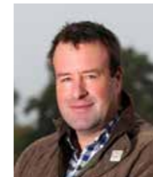
Stuart Roberts NFU Deputy President

We've also sought to strengthen cross-border working, to further reduce opportunities for individuals intent on causing the greatest threat, risk or harm to rural communities. In conjunction with Northumbria, Cumbria and County Durham Constabularies, Police Scotland formed 'Operation Hawkeye' designed to target transient criminals who focus their activities particularly on crossing national, local authority and policing boundaries. This produced evidence that many of those committing significant amounts of rural crime throughout Scotland, including ATM theft, acts of violence and high value crimes, originate from the North East of England, and are frequently associating with or connected to each other.