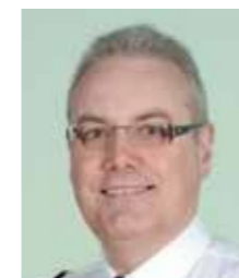
Superintendent Brian Kee Police Service of Northern Ireland (PSNI) Lead for Rural and Wildlife Crime

Importantly, it's not just farmers that want action. It's the public too. This was clearly demonstrated during the Police and Crime Commissioner elections in May when more than 50,000 people signed an open letter demanding action to tackle fly-tipping, and a further 19,000 supported changes to legislation to prevent dog attacks on farm animals. What's clear to me is that the election of new Police and Crime Commissioners can act as a reset moment, where they prioritise tackling rural crime and commit to levelling up policing for both urban and rural areas to create a safer, cleaner and greener rural Britain.