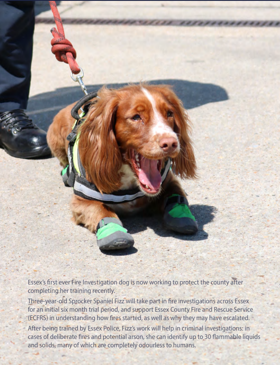
Essex's first ever Fire Investigation dog is now working to protect the county after completing her training recently. Three-year-old Sprocker Spaniel Fizz will take part in fire investigations across Essex for an initial six month trial period, and support Essex County Fire and Rescue Service (ECFRS) in understanding how fires started, as well as why they may have escalated. After being trained by Essex Police, Fizz's work will help in criminal investigations: in cases of deliberate fires and potential arson, she can identify up to 30 flammable liquids and solids, many of which are completely odourless to humans.