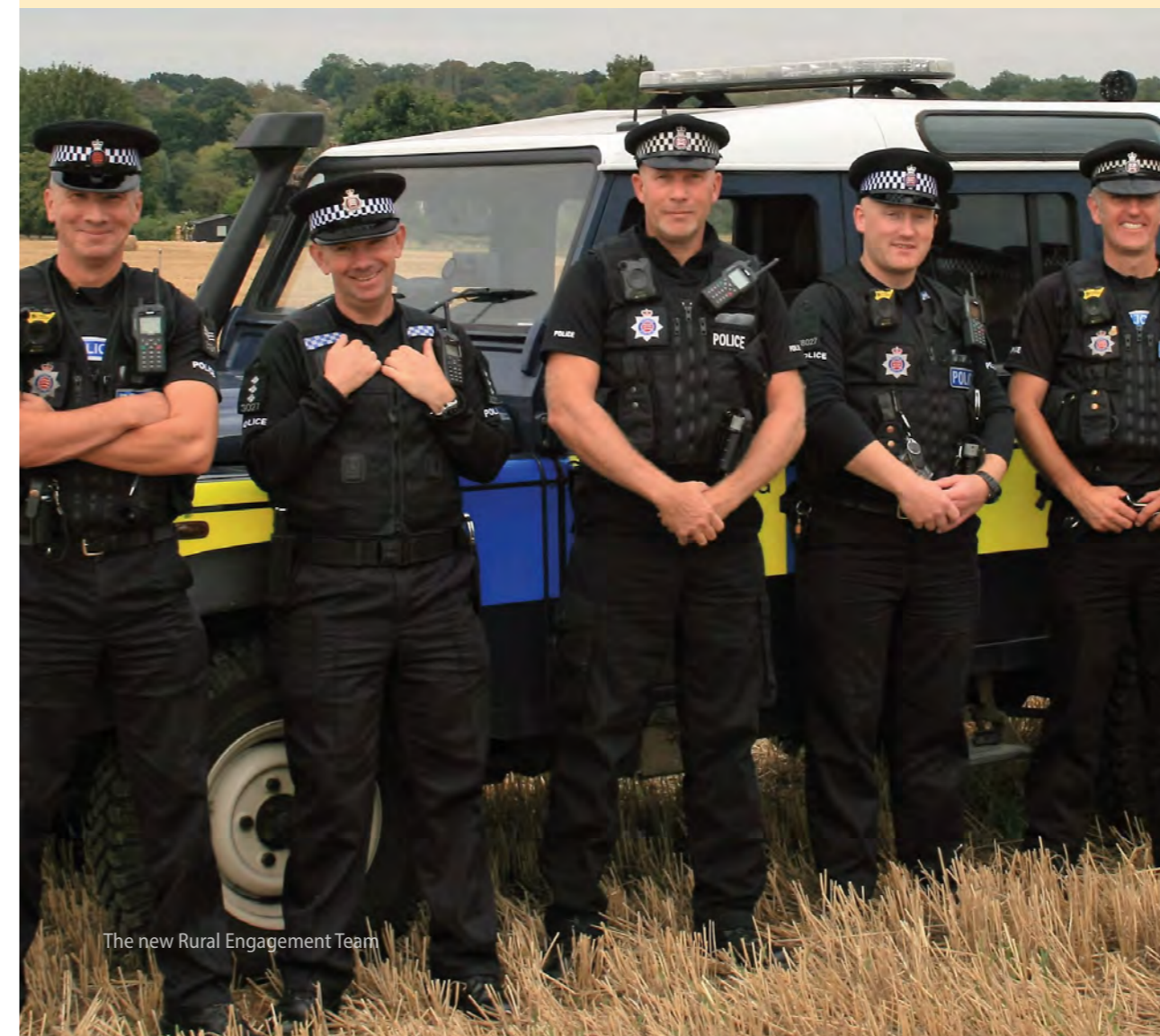
The new Rural Engagement Team

“Our objective is to ensure that crime prevention is based in the community, that victims come first, and that you know what is happening in your neighbourhood.”