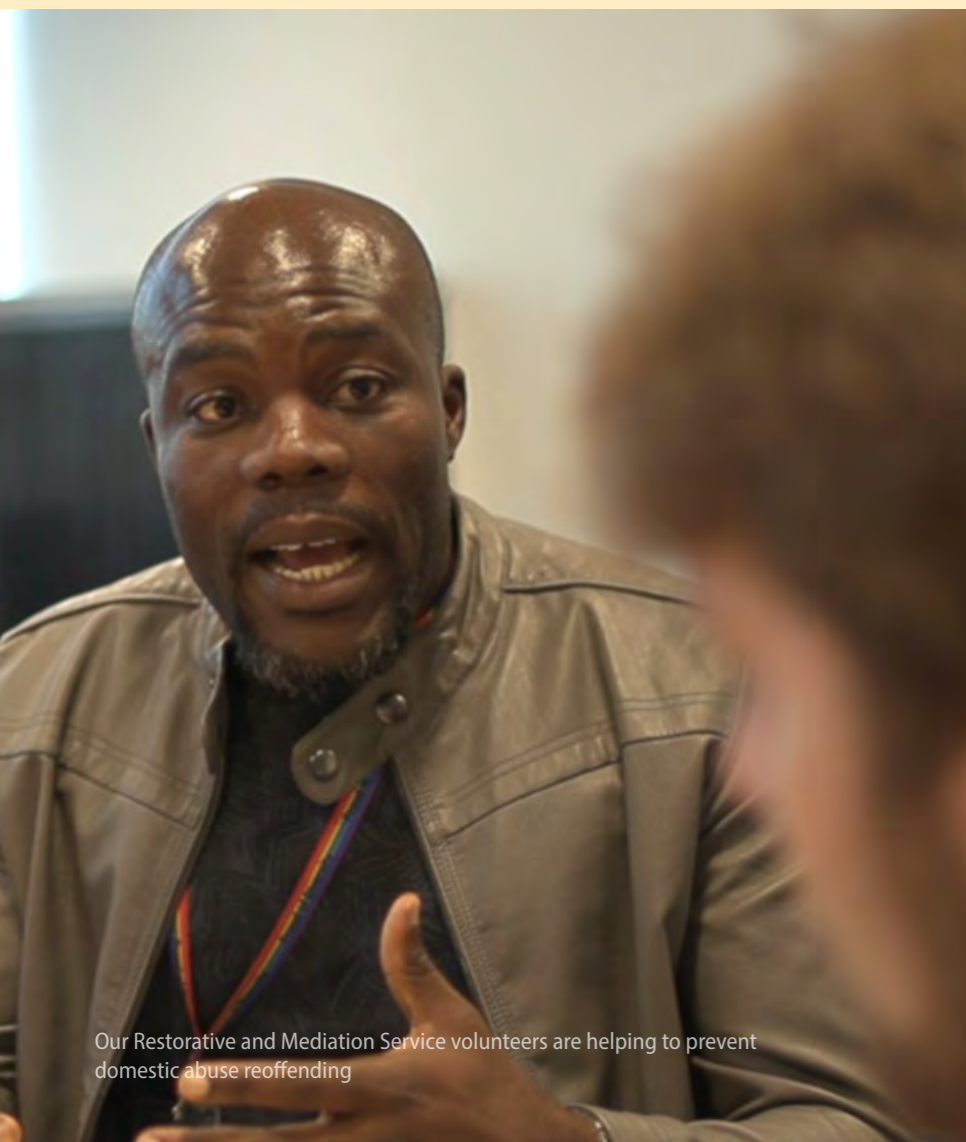
Our Restorative and Mediation Service volunteers are helping to prevent domestic abuse reoffending

“Our objective is to help those who suffer in silence and reduce the impact on children and families.”