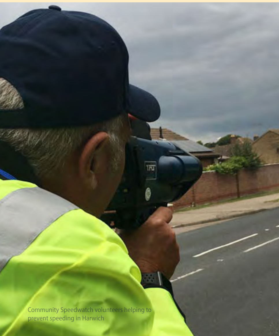
Community Speedwatch volunteers helping to prevent speeding in Harwich

“Our objective is to reduce harm on the roads and promote safer driving.”