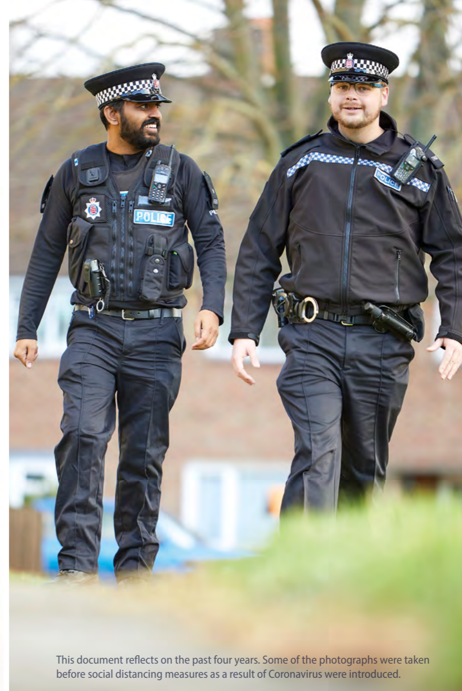
This document reflects on the past four years. Some of the photographs were taken before social distancing measures as a result of Coronavirus were introduced.